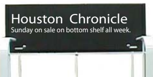
OPTIONAL 6 1/2" x 17 1/4" CARDHOLDER SHOWN WITH OPTIONAL IMPRINT