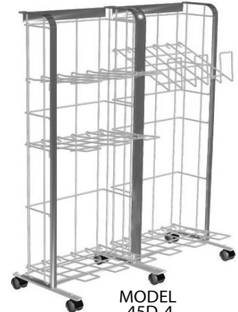
MODEL 45D-4 INCLUDES 4 WIRE SHELVES SHOWN WITH OPTIONAL WIRE SHELF 45"H x 34 1/2"W x 14 3/4"D SHIPPING WEIGHT 53 LBS