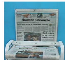
OPTIONAL PLASTIC TENSION PAPER HOLDER