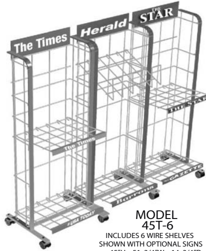
MODEL 45T-6 INCLUDES 6 WIRE SHELVES SHOWN WITH OPTIONAL SIGNS 45"H x 51 3/4"W x 14 3/4"D SHIPPING WEIGHT 79 LBS