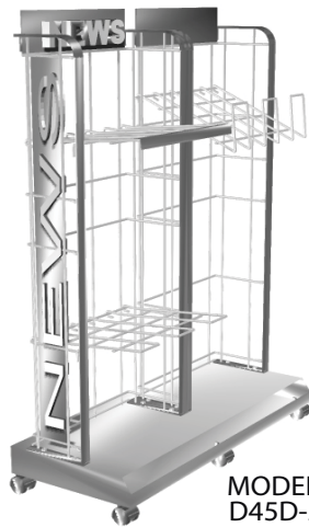
MODEL D45D-2 INCLUDES 2 WIRE SHELVES AND BASE SHELF -- SHOWN WITH OPTIONAL SIGN & SHELF 45"H x 34 1/2"W x 14 1/2"D SHIPPING WEIGHT 61 LBS