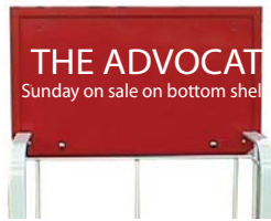
OPTIONAL 11" x 17 1/4" CARDHOLDER SHOWN WITH OPTIONAL IMPRINT