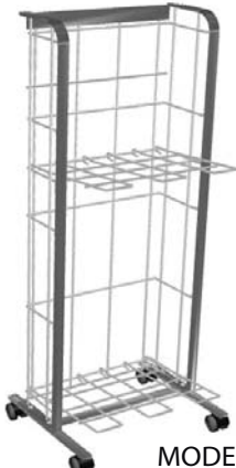
MODEL 45S-2 INCLUDES 2 WIRE SHELVES 45"H x 17 3/8"W x 14 3/4"D SHIPPING WEIGHT 27 LBS