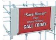
OPTIONAL 5" x 7" 3 LIP CARDHOLDER SIGN FOR SLANTED SHELF SHOWN WITH OPTIONAL IMPRINT