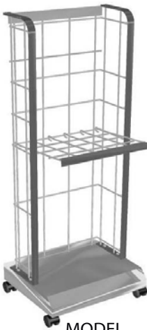
MODEL D45S-1 INCLUDES 1 WIRE SHELF AND BASE SHELF -- SHOWN WITH OPTIONAL SIGN 45"H x 17 3/8"W x 14 1/2"D SHIPPING WEIGHT 32 LBS