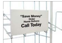
OPTIONAL 5" x 9 1/4" METAL SIGN FOR SLANTED SHELF -- SHOWN WITH OPTIONAL IMPRINT