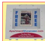
SPECIAL SIZE DOOR WITH OPTIONAL IMPRESSIONS