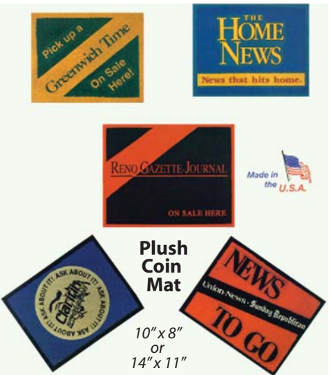
Plush Coin Mat 10" x 8" or 14" x 11"

Price shown is per mat, and include everything except shipping and a 50.00 set up fee per run. You pay nothing additional.